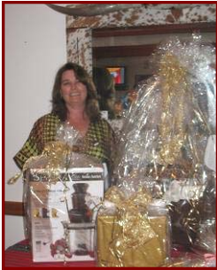
Above: Winner of Cow Chip Bingo

One of the highlights of the evening was awarding the fantastic Chocolate Party Basket to the winner of the Cow Chip Bingo. The roller carrying case, (compiled with the help of Helen Grace Chocolates and the Rolling Hills Covenant Turning Point adult fellowship class) weighed about 50 pounds and contained nothing but Helen Grace and Sees chocolate products. In addition to the chockfull carrying case, the lucky winner also received an exquisite chocolate fountain and a fondue set.