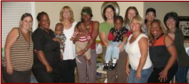
Pictured to the left are the Ladies of Harley who came to donate the proceeds of their yard sale to the women and babies residing at "Building Hope."

The number of homeless and low-income families coming to receive assistance with food, diapers, clothing, personal care products, emergency housing and rent subsidy has increased more than 300%. In January of 2008 Community's Child assisted 272 South Bay residents, compared to 712 resident in October of 2008. We are very pleased to report that with YOUR SUPPORT we have not had to turn away any one in need. On behalf of those we have had the "Privilege of Serving," we THANK YOU from the bottom of our hearts for your ongoing generosity. May God Bless you as richly as you have blessed the lives of those most in need.