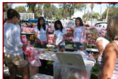
Pictured Above: The Ek Kardia Teens working hard to set things up "just right."