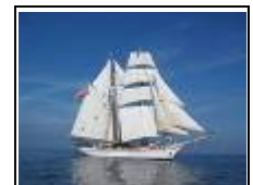
Los Angeles Maritime Institute Top Sail Youth Program.