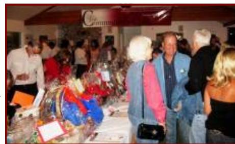
Pictured Above: Guests Bidding on more than 50 Amazing Auction Items