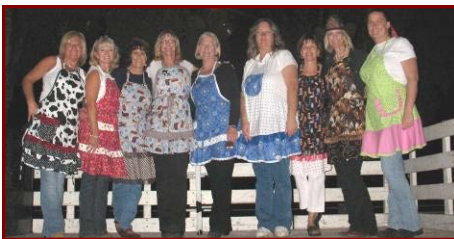
Above: Committee Members & Event Volunteers Auction Off Their Aprons